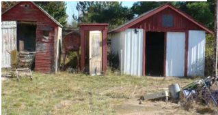
Really... a picture from the car?