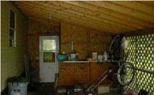
Rust stains not a plus!