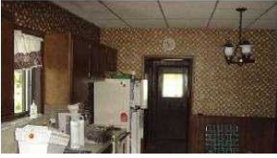
All the clutter doesn't help sell the property!