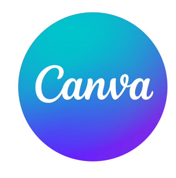
**not taught by a certified Canva instructor