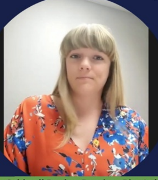
Coldwell Banker Brenizer-Rice Lake Years in Real Estate: 4 years

"I'm already currently serving, I really like it and I feel like I can bring more to the table. I would like to bring a newer agent's perspective to it."