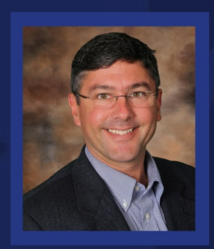
RE/MAX Afilliates Years in real estate: 23 years