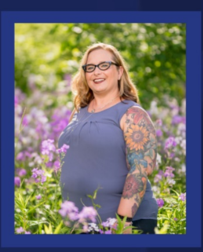
Coldwell Banker Brenizer Years in real estate: 7 years